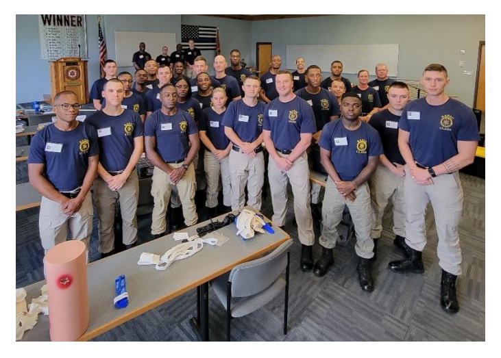
April 3, 2023, graduating class receive Stop the Bleed ® training from MTCSF Staff.

The partnership MTCSF has with MLEOTA is training our next generation of law officers to save the lives of Mississippi, thanks to the MSDH grant program.