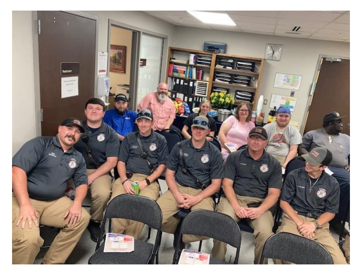
Representatives from Columbia Fire Department, Columbia Police Department, and Foxworth Volunteer Fire Department