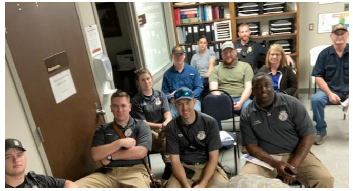
Representatives from Columbia Fire Department, Columbia Police Department, Foxworth Volunteer Fire Department, and Southwest Marion Volunteer Fire Dept.

MTCSF Host Multi-Department Stop the Bleed Training at Marion General Hospital March 8 & 9, 2023